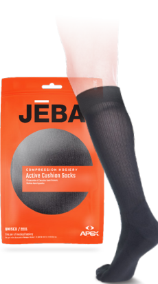
UNISEX Active Cushion Knee-High

Sku: J2030WSVPN Color: Neutral Size: M, L, XL