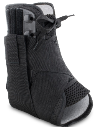
Elite Armor 8 Lace Up Ankle Brace