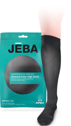
WOMEN'S Diamond Knee-High

Sku: J2030WSVPB Color: Black Size: M, L, XL