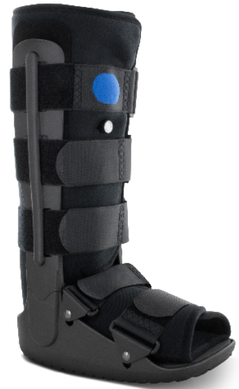
Elite Pro Select Air Walker High Top

We offer quality DME products at affordable prices to help meet your patients' needs.