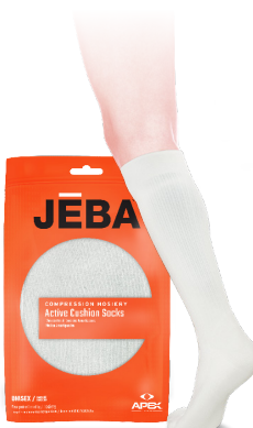
UNISEX Active Cushion Knee-High

Sku: J2030WSVTHB Color: Black Size: M, L, XL