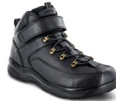
A4000M Color: Black Depth: 5/16" Width: M, W, XW Sizes: 7-13,14,15