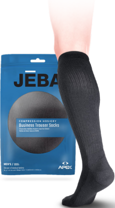
MEN'S Business Trouser Knee-High

and 20-30 mmHg (Moderate-Firm Compression)