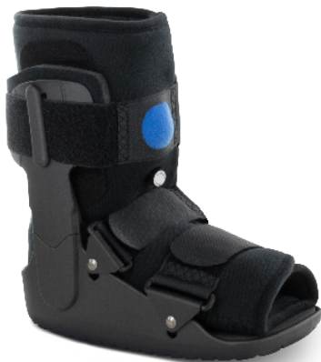
Elite Pro Select Air Walker Low Top