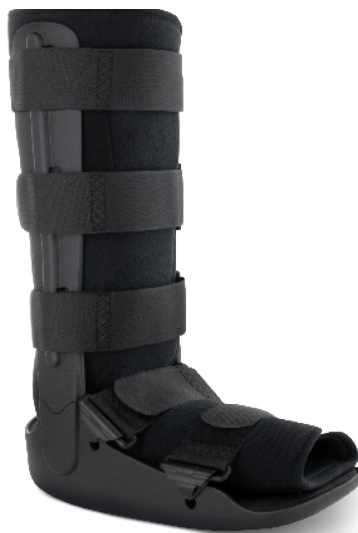
Elite Pro Select Walker High Top